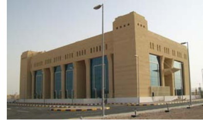
Ghayathy Police Station

Recently, Project Management Department had witnessed a joyful moment to announce the delivery of several accomplished projects. In Western Region the Sila Police Station project has been completed within 16 months with total value of 56 million Dhs. The second project in Western region is Ghayathy Police Station project which has been completed within 12 months with total value of 55, 2 million Dhs.