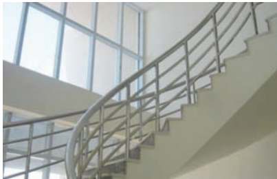
Sila Police Station