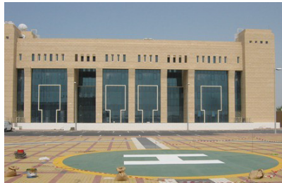
Sila Police Station