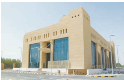
Ruwais Police Station