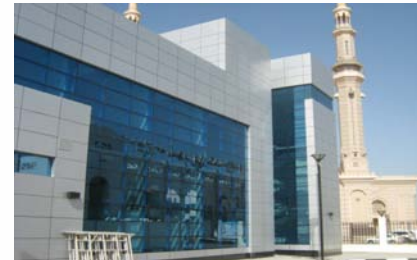
Civil Defense- Been Al Gisreen